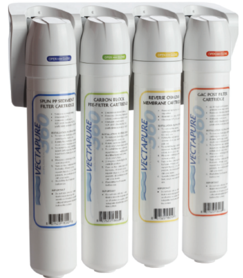
Four Stage 75 GPD RO System Includes tank and accessories V3604RO