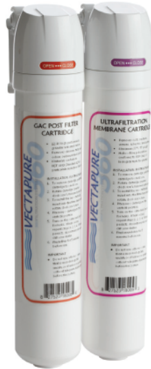
Dual Stage Filter System Sediment and CBC V3602SC