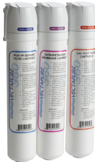
Triple Stage Ultrafiltration System Zero waste and no tank required V3603UF